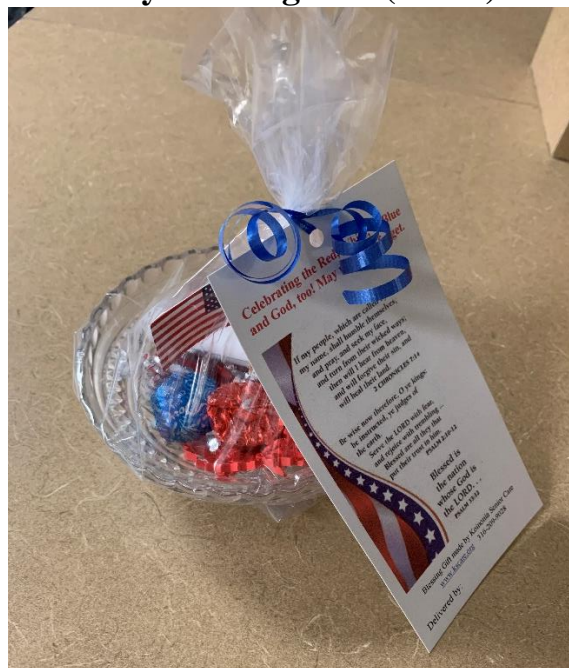
July Blessing Gift (side 1)