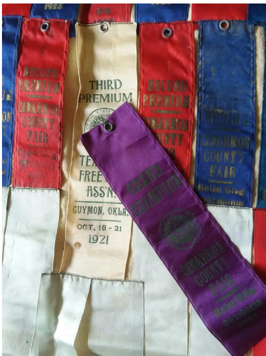
The Purple Ribbon for Mamma's Chocolate Devils food 5-layer Cake

On the last day of the fair, I wondered where did they ever find so many red, white, and blue ribbons to attach to the numerous items. And then ones without ribbons were very nice, too, and they deserve to be displayed. That's what makes a wonderful fair! I noticed our family had their share and, in the mix, there was a lovely purple ribbon . Not many did you see in purple. This one was on Mamma's Chocolate Devils-food cake of 5 layers! A GRAND CHAMPION! Yippee!