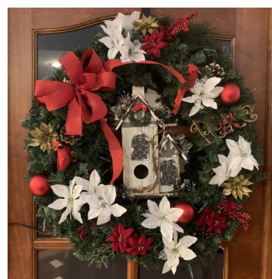
Chrysanthemums and Bird Houses