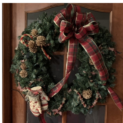
I've Got Your Mittens!