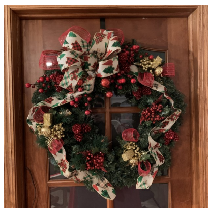
Christmas Eve with Jesus