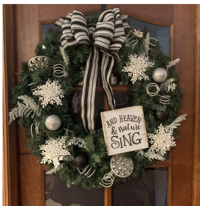
Heaven and Nature Sing