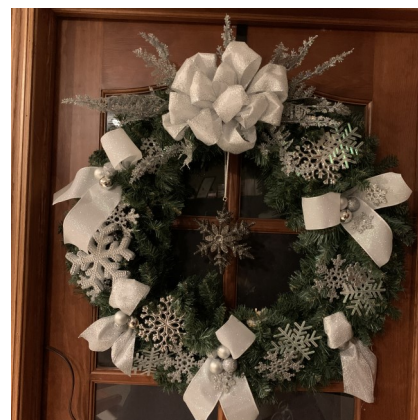
White as Snow