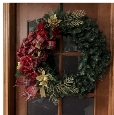
Tribute to Parents