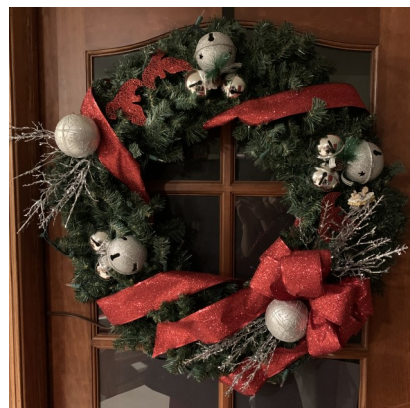
Christmas JOY Bells