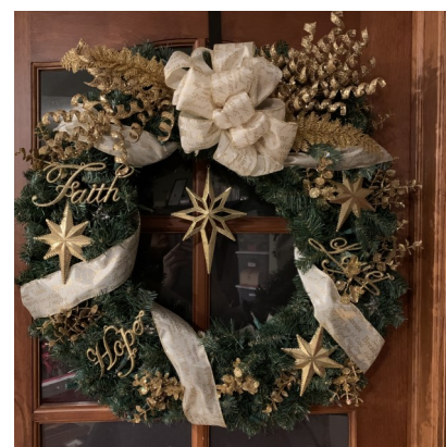
Names of the Messiah