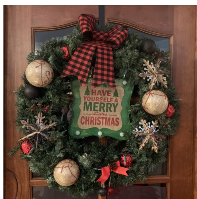
A Merry Little Christmas