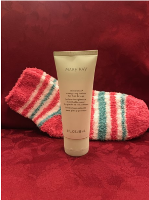
Mint Bliss Energizing Lotion for Feet and Legs w/fuzzy socks Buy 1 & we GIFT one! ($11)

Satin Hands Set Buy 1 & we GIFT 1 Mint Bliss w/fuzzy socks and 1 Satin Hands w/Manicure Set ($36)