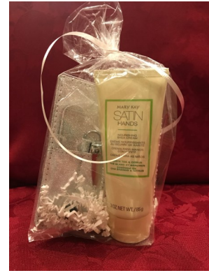
Satin Hands w/Manicure Set Buy 1 & we GIFT one! ($12)

Gift-wrapped and personally delivered to a local long-term-care community with treats and caroling! You are welcome to carol with us!